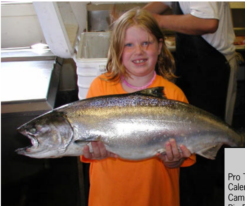
A very happy angler shows off her catch at this year's inaugural Junior Coho Derby.